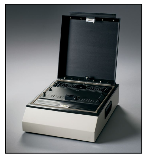
Model LR:8028: Component test fixture optimized for device testing up to 200V/1A. Includes color-coded mini jumpers for easy device connections.

For use with: 4200-SCS, Series 2600B, 6482, any 40V rated triaxial or SMA instrument