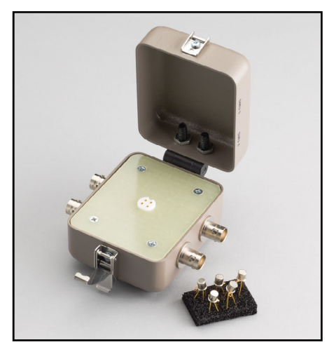
Model 8101-4TRX: 4-pin transistor fixture. For use with: 4200-SCS, Series 2600B, 6482, any 40V rated triaxial instrument

For use with: Model 2651A High Power System SourceMeter