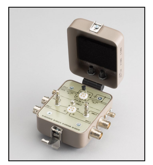
Model 8101-PIV: DC and pulse I-V demo fixture that is a metal case with four female triax connectors, two SMA connectors, and a latch. Inside the test fixture are two 4-pin device holders (transistor sockets) and two plungers for parts with two leads.

For use with: 4200-SCS, Series 2600B, 6482, any 40V rated triaxial or SMA instrument